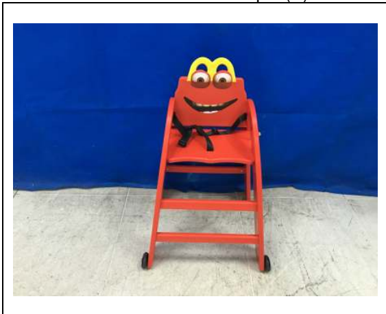
Front view of test sample (B)