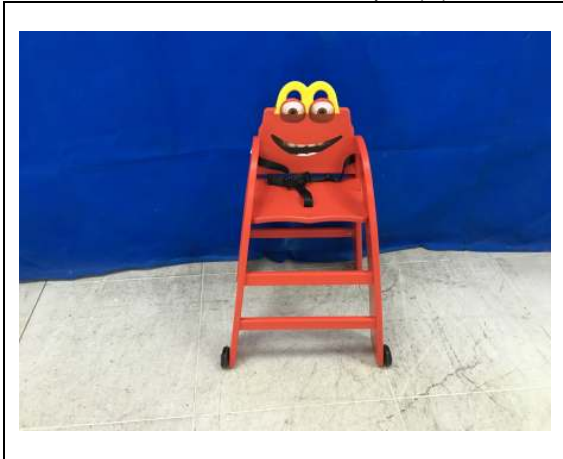
Front view of test sample (A)