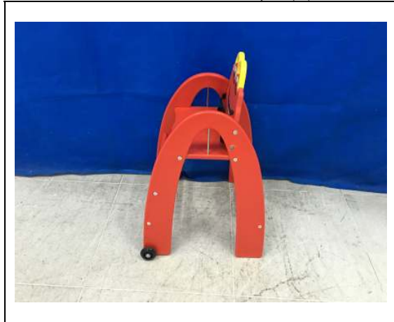
Side view of test sample (A)