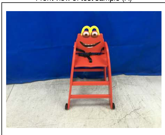
Front view of test sample (A)