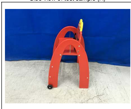
Side view of test sample (A)