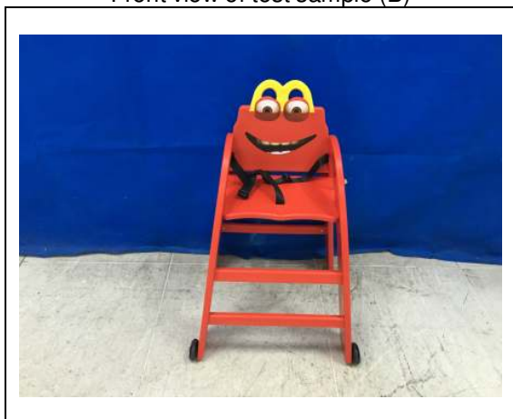
Front view of test sample (B)